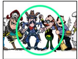
1.33 Full Frame Center Extraction