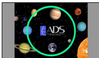
1.33 Side Matted or 1.33 Pillar Box