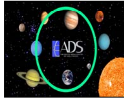
1.78 Full Frame Anamorphic