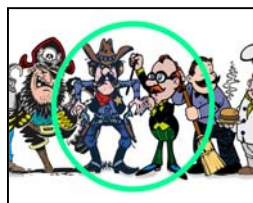
1.33 Full Frame