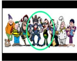
2.35 Letterbox Anamorphic