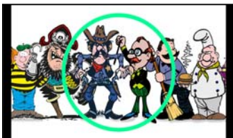
1.66 Side Matted