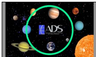
1.66 Side Matted