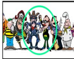
1.85 Matted Anamorphic