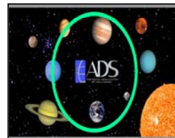
1.85 Matted Anamorphic