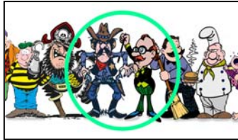
1.78 Full Frame