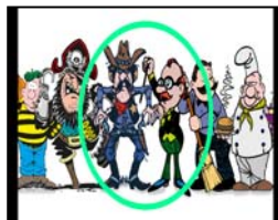
1.66 Side Matted Anamorphic