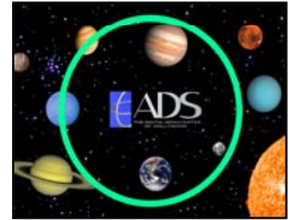
1.33 Full Frame Center Extraction