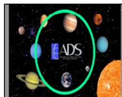
1.66 Side Matted Anamorphic