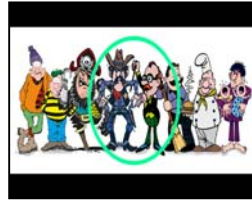
2.35 Letterbox Anamorphic