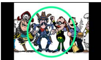
1.33 Side Matted or 1.33 Pillar Box