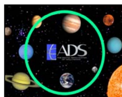
1.33 Full Frame