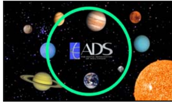
1.78 Full Frame