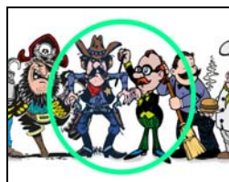
1.33 Full Frame