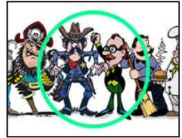
1.33 Full Frame Center Extraction