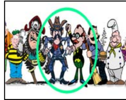
1.78 Full Frame Anamorphic