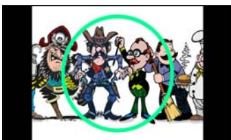
1.33 Side Matted or 1.33 Pillar Box