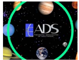
1.33 Full Frame Center Extraction