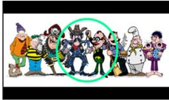
2.35 Letterbox * Original Film Aspect Ratio