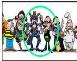
1.85 Matted Anamorphic