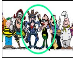
1.78 Full Frame Anamorphic