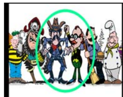
1.66 Side Matted Anamorphic