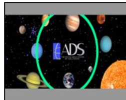
2.35 Letterbox Anamorphic